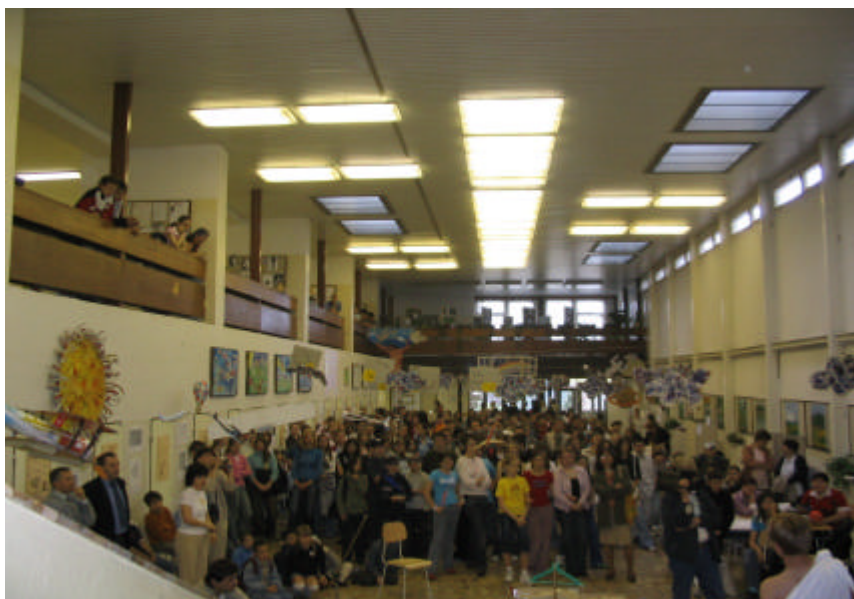
Participants of the Physics Day.