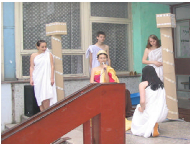
Performance: Episode from the life of Archimedes.