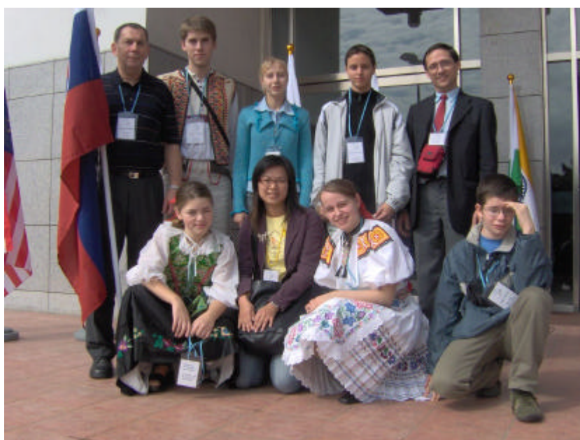
The Slovak delegation (with Taiwanese guide) in Taipei.